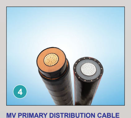
MV rated 35kV with TRXLPE insulation and XLPE jacket, with AL or CU conductors; used for runs to transformers. Features "Discharge-Free" design.