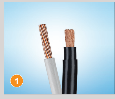
SOLAR ARRAY CABLE Copper PV Wire used to interconnect solar arrays or other electrical components. Rated at 2000V with cross-linked polyethylene (XLPE) jackets for durability.

For Solar Power, Remee offers PV (photovoltaic) wire in aluminum or copper for interconnecting solar arrays, collection cables to connect the panels to intermediary collection points, and MV (medium voltage) cables in aluminum or copper to transmit power to the substation.