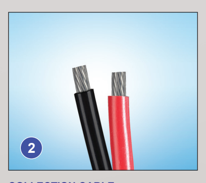
COLLECTION CABLE Aluminum PV Wire used to connect solar panels to the combiner box. Rated at 2000V with cross-linked polyethylene (XLPE) jackets for durability.