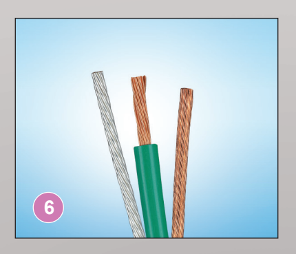
GROUND WIRE Bare Stranded Copper Ground Wire with tinned copper and insulation options.