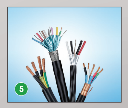
SUBSTATION CABLE Copper Power Control and Instrumentation Cables, shielded and unshielded.