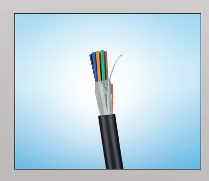
FIBER OPTIC CABLE Interference-free SM Fiber Optic Cables for backbone communications. Loose tube and unarmored, available with gel or dry AquaLock® Fiber in duct available on request.