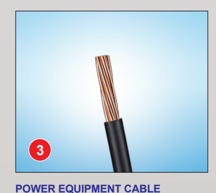
DC Feeder cables used to connect to the transformer. RHH/RHW-2/USE-2 cable shown